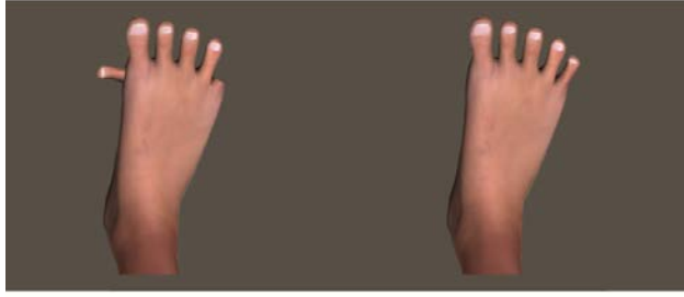
Figure 3. Examples of a reorganized foot (E) and intact foot (F).